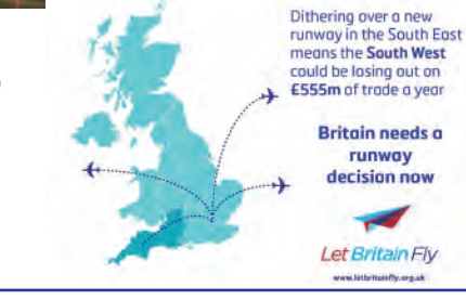
Regional Roundtables With 116 business supporters in Newcastle, Newquay, Liverpool, Edinburgh, Cardiff, Belfast & Exeter